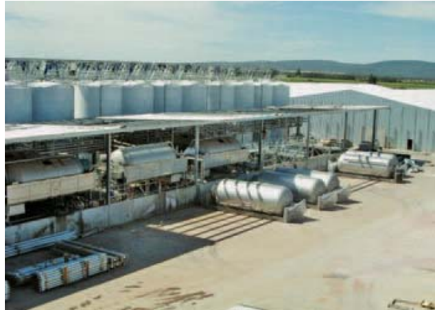
Presses at Casella Wines

Vardanega also highlighted the quality aspect. "Already utilising Della Toffola equipment in the cross flow filter, RDVs, destemmer